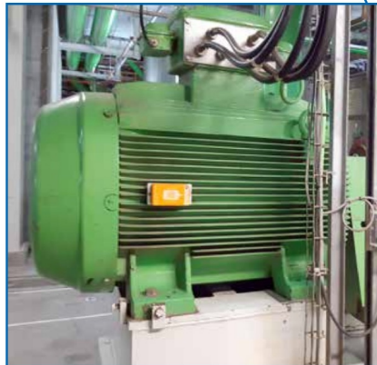
Closed Cooling Circuit Pumps PGB