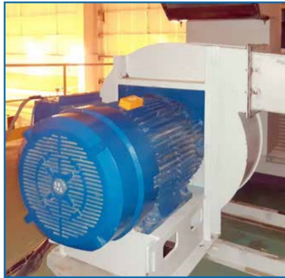
Turbine Enclosure Cooling Fans 88TK