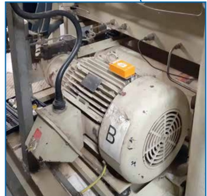
Hydraulic System Pump HPU