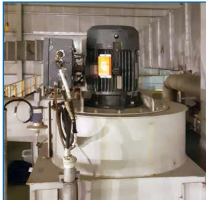
Turbine Bearing Cooling Fans 88BN